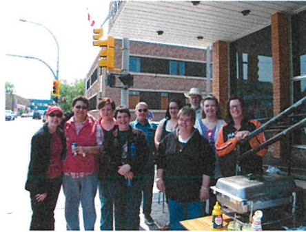
Flin Flon Public Library and The Pas Regional Public Library at Customer Appreciation Day in Flin Flon