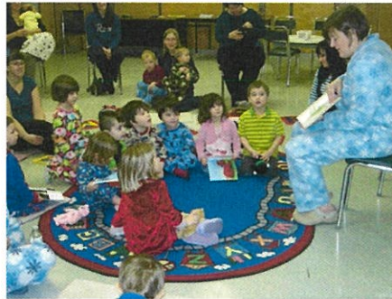
Family Literacy Day