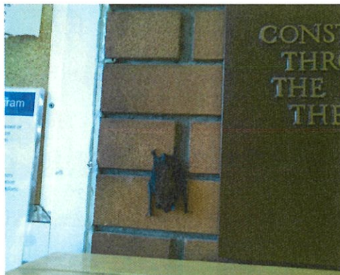
New patron at the library

In June we had special patron that wanted to come in and join the library. A bat was found on the wall in the entranceway to the library.