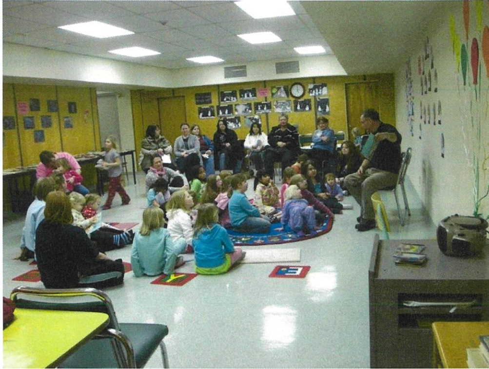
Mayor George Fontaine was one of the guest readers during Family Literacy Day